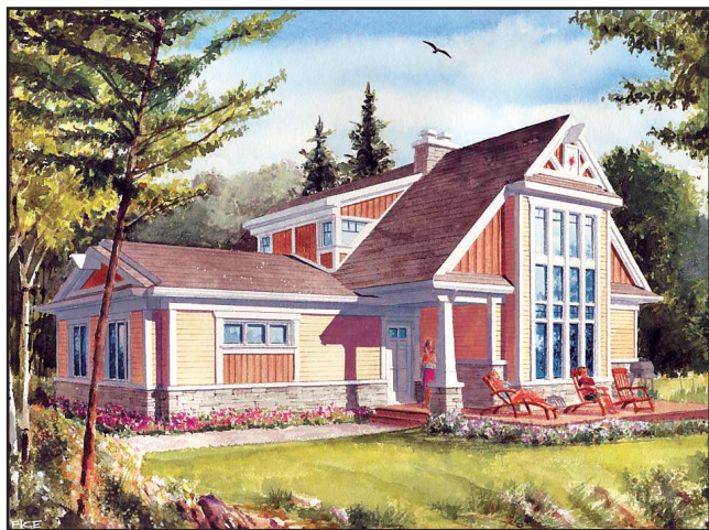
The Maple Cottage at The Landscapes, Lake of Bays.

Membership also entitles owners to discounts on such perks as private jet rentals, yacht charters, elite automobile rentals, Abercrombie & Kent worldwide travel and access to premier sporting events.